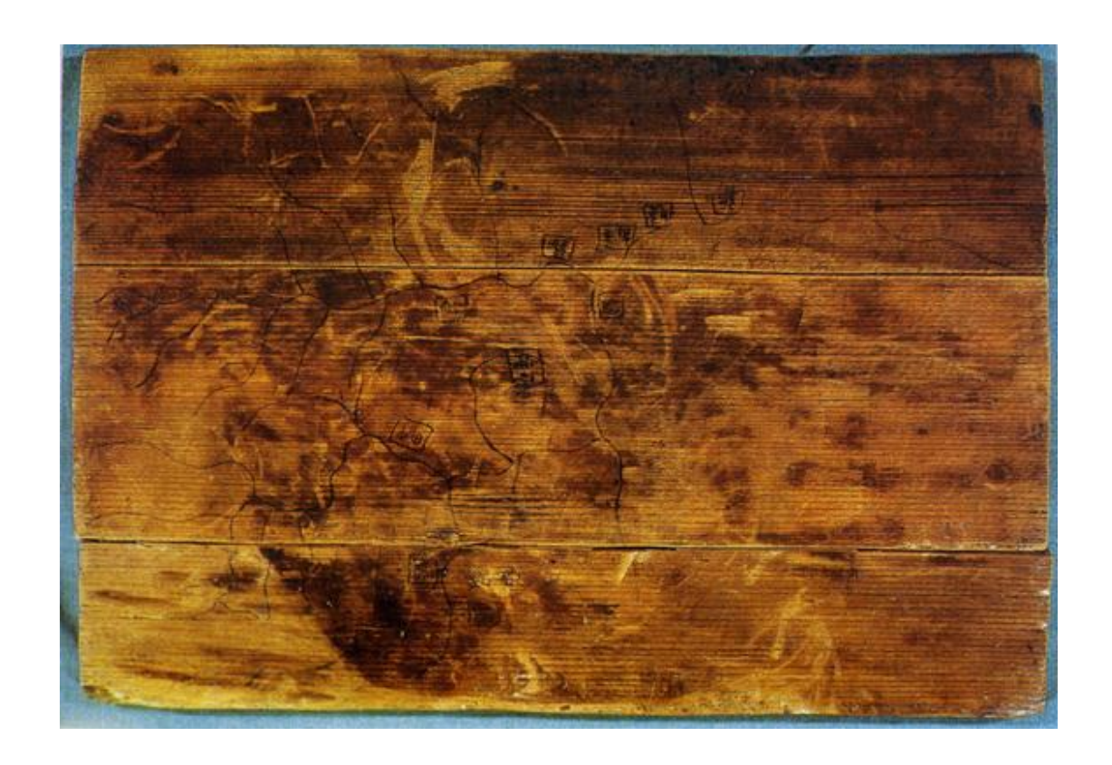
Map 4 unearthed in the No. 1 tomb

Fangma tan maps are placed inside square frames, some larger than others, to indicate administrative importance (more on this below). Rivers, roads (marked with the generic dao 道), water systems, and forest resources are also indicated. Map no. 4 (of the seven Fangma tan maps) is essentially an administrative map of Guiqiu 邽[郌]丘 town. Note that the larger, square-bracketed place-name in the center of the map designates the town, so-called probably because it was situated on a qiu, or hill. The other six maps found in the tomb represent sections of the territory depicted on Map no. 4.