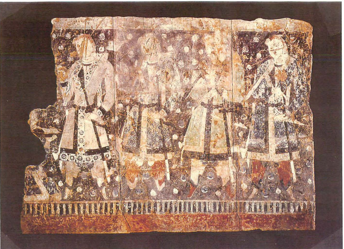
Color Plate: Four Tocharian Knight-Donors. From the "Cave of the Sixteen Sword Bearers", Qizil, 600-650 CE.

Ulf Jäger, "The New Old Mummies from Eastern Central Asia: Ancestors of the Tocharians?" Sino-Platonic Papers , 84 (October, 1998)