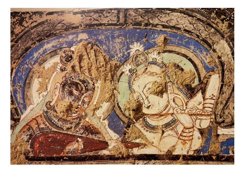
Figure 11 . Kizil Cave 38, east lateral wall topmost section, Two Heavenly Musicians, detail.

Monika Zin in the last twenty-five years more than once has expressed staunch support for the traditional German chronology, which she still supports. In a 2013 presentation at Kyoto University, she stated: "Gandhara—Kucha—Turfan: this is the sequence which indicates the flow of artistic representations from India to China," which can be interpreted to affirm that Kucha might have acted merely as a transit area rather than as an independently creative one.<sup>54</sup> Zin also considers the possibility that Gandharan paintings, whose problematic survival is discussed above, might have been a model for Kucha's. She does agree with Schlingloff that Kucha is dependent on Ajanta, if seen from the perspective of their painting arrangements: "The planned narrative program, representing certain scenes in certain spots, connects Kucha much more with the non-linear representation of India."<sup>55</sup> In a 2013 Kyoto University presentation, Zin also referred to chronology: "Notwithstanding the similarities with Ajanta or the dissimilarities with Gandhara, many scholars tend to date Kizil quite early, immediately following