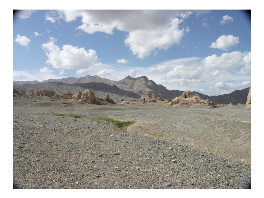
Figure 4. View of West Subashi site.