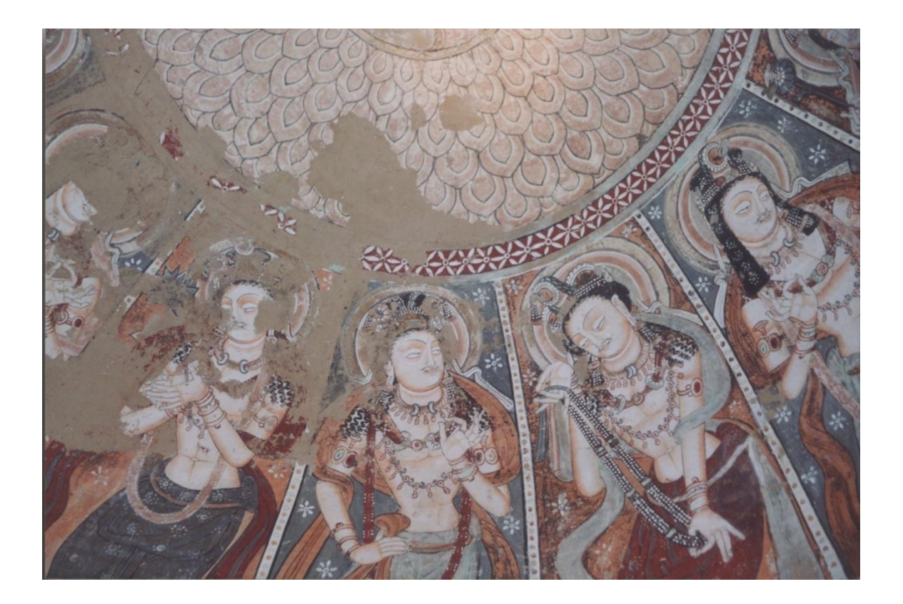
Figure 7. Kumtura Cave painting. Lunette, Cave 21, detail.

Likely progenitors of the Tocharians, for example, were the earlier Afanasevo (3300–2500 BCE) and the later Andronovo (1700–1500 BCE), both mobile, pastoral cultures whose people abandoned their tribal status. By circa 1000 BCE, Andronovo people had moved south to settle in the Tarim Basin area, specifically in the land which became Kucha. When, in 1979, forty-two ancient tombs were discovered in Xinjiang (lower Kongque River valley), their discovery cast further light on the origin of the Tocharians. The tombs revealed the Gumugou culture, whose people had Caucasoid features with physical characteristics similar to Northern Europeans. Moreover, the 1994 discovery of Xinjiang mummies, also with Caucasian features, indicated that these residents of the Tarim Basin were quite likely Tocharians.<sup>43</sup>