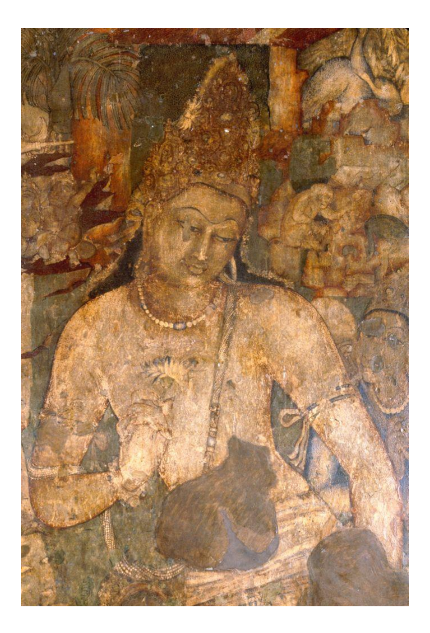
Figure 10 . An example of Ajanta paintings: Bodhisattva Padmapani , likely dated to 477 AD. Image source: Mary Binney Wheeler, 1978. Detail of a mural painting of Bodhisattva Padmapani (Avalokitesvara), Cave 1, Ajanta, Maharashtra, India. South Asia Art Archive, Mary Binney Wheeler Image Collection. https://library.artstor.org/asset/SS37691_37691_41109358.

Unlike Ajanta, Tocharian paintings do not strive for realistic effects, nor seek the sensuality of Ajanta in portraying feminine beauty. Tocharian artists, instead, seemingly focused on the religiosity of the subject matter and avoided contemporary social relationships. The musicians of Kizil's Cave 38, for example, do not reflect the human world even if their musical instruments belong to it (Figure 11).