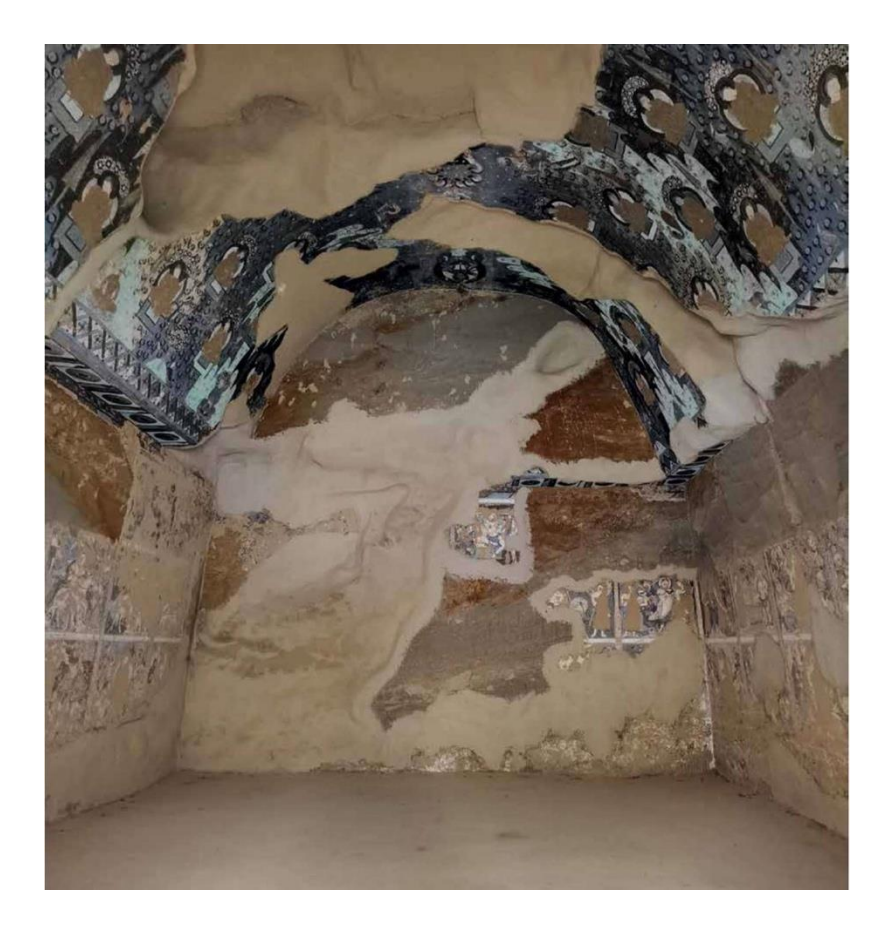
Figure 6A . Interior of Cave 110, main hall. Image source: Zhao Li 赵莉. "Kezi'er shiku bihua fuyuan yanjiu" 克孜尔石窟壁画复原研究 [Research on the Restoration of Kizil Cave Paintings]. 2 vols. (Shanghai: Shanghai shuhua chubanshe, 2021), 240, fig. 1.