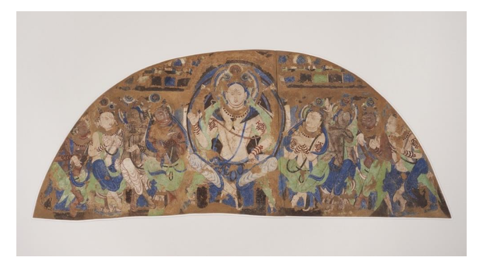
Figure 3. Maitreya Pure Land, lunette, originally in Kizil, Cave 224 (Mayahöhle 3. Anlage). Presently in Museum für Indische Kunst, Berlin, Inv. Nr. 8836.

In my 2015 collaboration with Giuseppe Vignato, our work was based on all extant Kucha sites visited and studied in 1995 and 2006; it did not discuss dating. Instead, our investigation distinguished between Styles A, B and C, C referring to the Chinese style, while A and B were the same as the German division into the aforementioned First Indo-Iranian Style and Second Indo-Iranian Style.<sup>12</sup>We cautioned that decoration is an inadequate starting point to address Kucha's dating, that there are risks in using style to define it, because "there are specific instances in which one earlier style painting is covered by a layer of a later style, as is the case in the inner left corridor of Kizil Cave 47."<sup>13</sup> We also pointed out that some original caves were altered at a later time and yet retained their former decor.