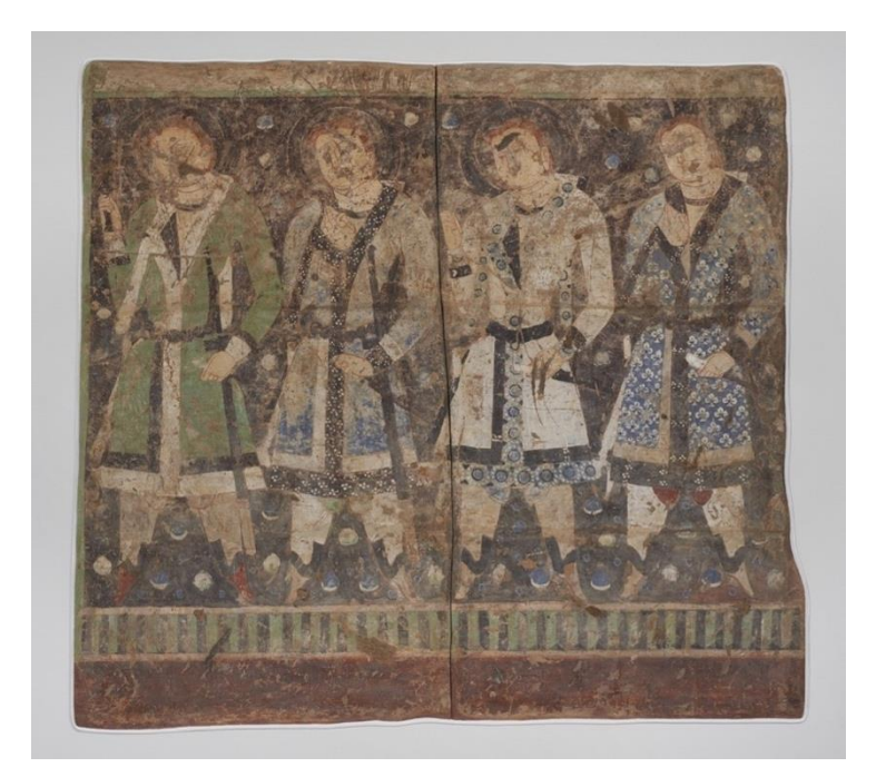
Figure 9. Tocharian donors, originally in Kizil, Cave 8 (16 Schwertträgerhöhle), Museum für Indische Kunst, Berlin, Inv. Nr. III 8691.

The economic transactions written in Tocharian B highlight the clergy's primary role in the Tocharian community. The theatrical pieces, also in the same language, open a window on the cultural life of the latter. Tocharian B language was the language of choice in the country's economy and literature. Thus, its use strengthens the argument that Kucha's paintings are Tocharian rather than Indo-Iranian derivatives.