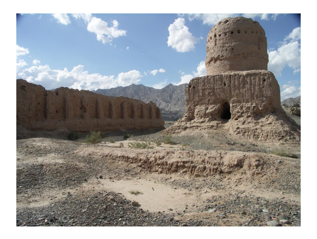
Figure 5. View of East Subashi, stupa court.