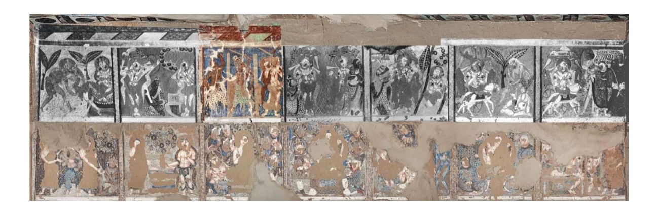
Figure 6B. Rows of Jataka stories, reconstruction. Cave 110, main hall, right wall upper center.

Figure 6A . Interior of Cave 110, main hall.