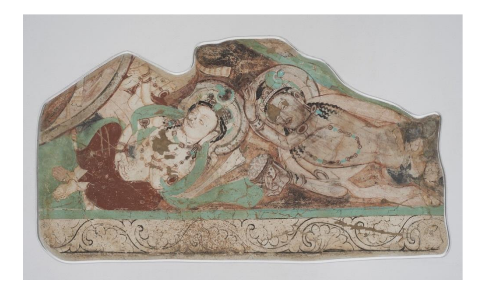
Figure 2 . Fragment of two Bodhisattvas from a cupola ceiling, originally in Kumtura, (Zweite Kuppelhöhle). Museum für Indische Kunst, Berlin, Inv. Nr. III 9053.

China].<sup>"••</sup> Waldschmidt was referring to two different, influential styles: the Western being India and Persia, the Eastern being China, possibly implying Later Tang and Uyghur styles. Moreover, he identified three styles and dated them on the basis of paleographic features, which he did not specify, of the Brahmi inscriptions, which accompanied the paintings: the First Indo-Iranian Style (ca. 500), the Second Indo-Iranian Style, circa seventh century, and the Chinese Style (ca. eighth to ninth century).<sup>11</sup> Most Western scholars have not challenged Waldschmidt's dating, by which the year 500 coincides with the beginning of Kucha's painting. Waldschmidt also added the following distinction: the First Indo-Iranian Style applied to square caves, while the Second Indo-Iranian Style was unique to central pillar caves, a distinction we still consider valid. Rounder forms enriched by warm tonalities of colors characterize the First Indo-Iranian Style (Figure 2), while in the Second Indo-Iranian style, color prevails over volume and bodies are contoured by sharp lines and enriched by vivid tones of lapis blue and green (Figure 3). Both styles are further discussed below.