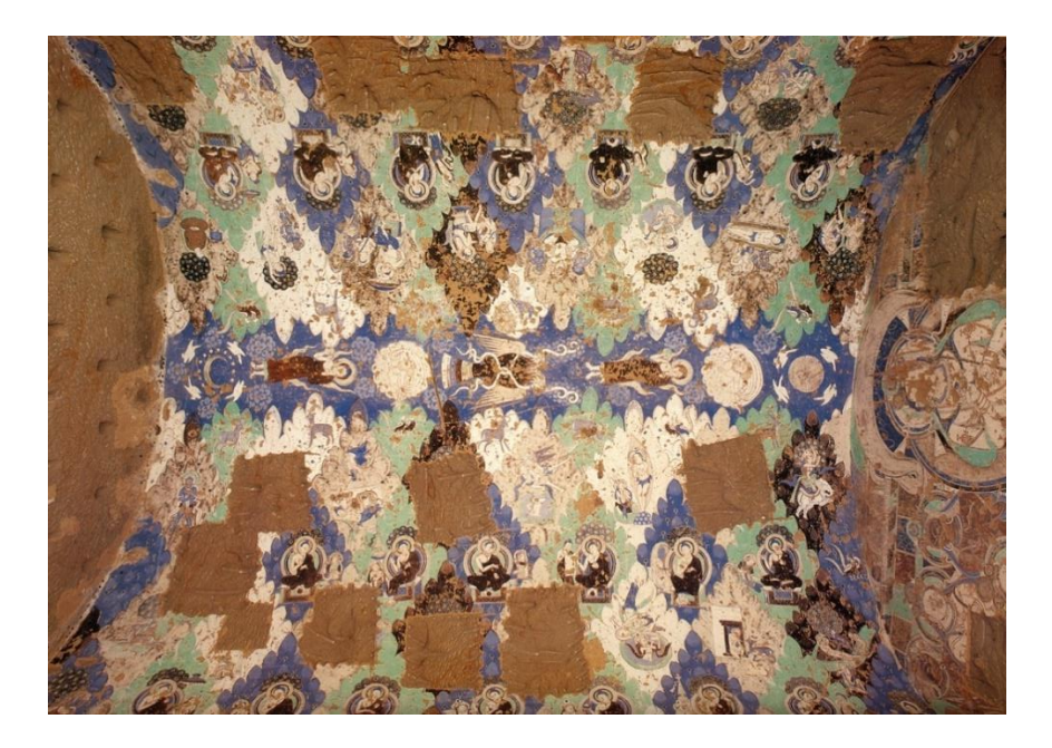
Figure 12 . Kizil Cave 38, crest of ceiling, partial view, showing examples of scalloped rhombic shapes.

In conclusion, the originality of Kucha's art is built to a significant degree on its own interpretation of Buddhist teaching and its own distinctive style. This is not to deny any outside influence, but Kucha's originality becomes evident when one visits its religious compounds and takes note of the rich complex of caves that display an exclusively indigenous approach to size, arrangement, and decoration. Kucha consisted of eight large rock monasteries distributed throughout the kingdom for a total of 650 extant caves—at Kizil Qargha, Simsim, Mazabaha, Kizil, Tograk-eken, Wenbashi, Taitai'er, and Qumtura. In addition to the cave sites, Duldur Aqur and Subashi stood as imposing religious cities, likely administered directly by the court and upper clergy. The arrangement of the rock monasteries varied depending on the extent of each site as well as on the terrain. For example, only the forty-four caves of Mazabaha were built on an arid plateau, while the 235 numbered caves of Kizil were set on a fertile location with abundant water and trees. In Kizil, it is clearly visible that the size of the site determined whether the caves were employed for worship, for monastic gatherings or residence, or for meditation. In contrast, the Mazabaha caves relied on chiefly undecorated, tunnel-shaped caves, accessed through a very large antechamber and perhaps suitable only for meditation (Figure 13).